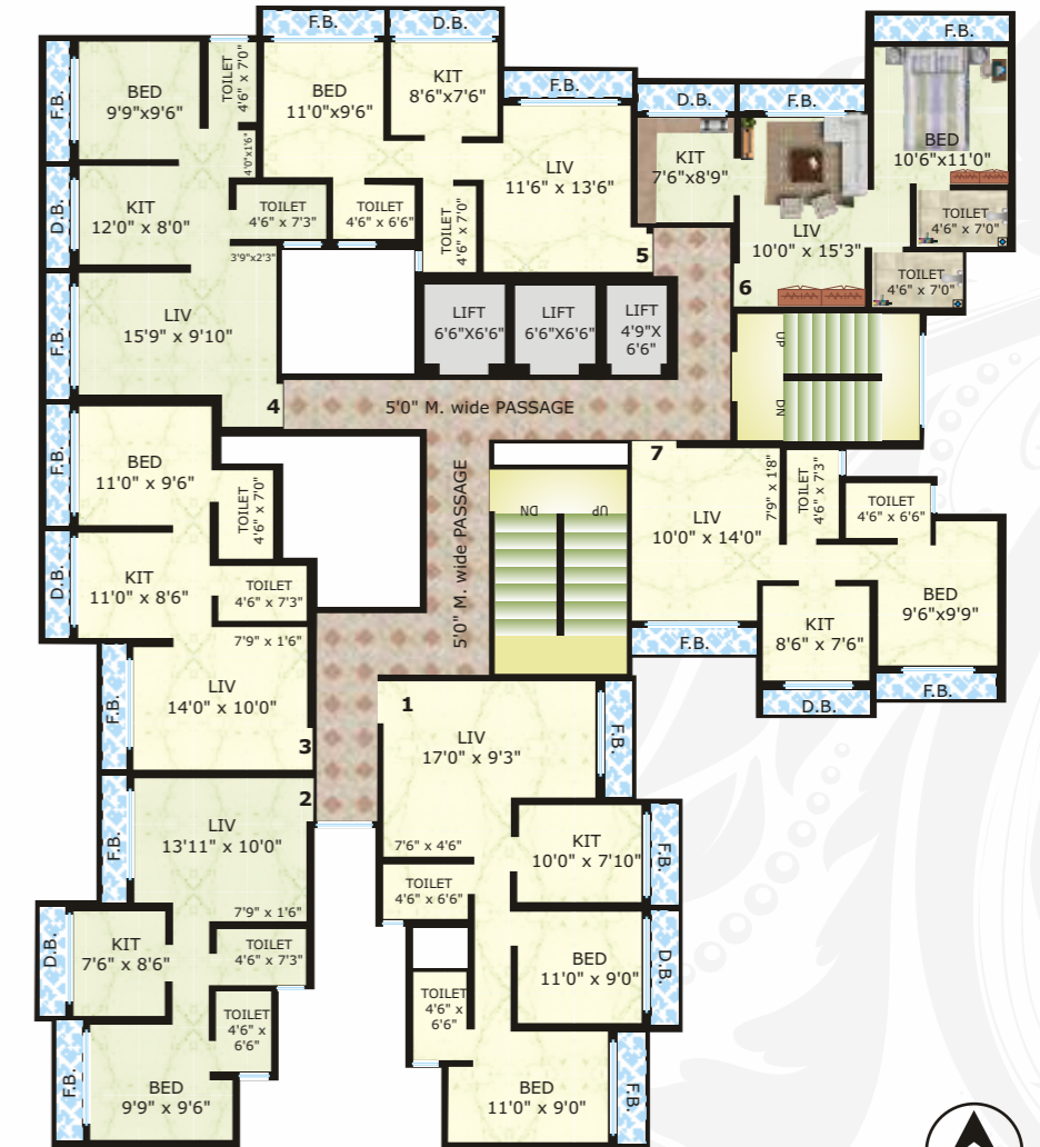
2 nd to 15 th TYPICAL FLOOR PLAN